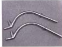
Guard Hardware model 63390