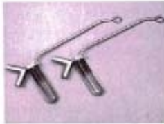
Strand Hardware model 63350