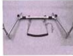
Ladder/Pole Hdw model 63380