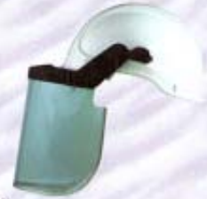
VH500 cap attachable visor holder.