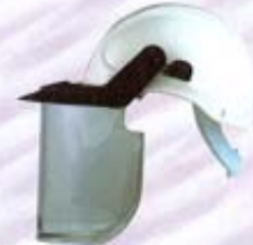
VH500P cap attachable peaked visor holder.

BROWGUARD KITS Browguards complete with visor. • VC105 VV848 visor with VV997 ratchet browguard. • VC109 VV848 with VV998 pinlock browguard.