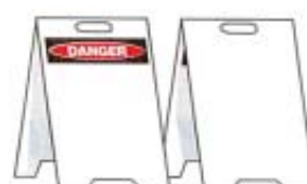
(legend 1) (legend 2) 839079