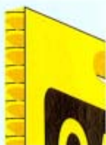
Lightweight corrugated plastic for indoor use or secured outdoor use.