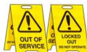
(legend 1) (legend 2) 839072