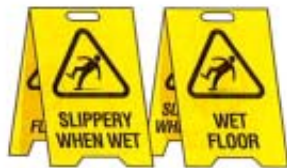
(legend 1) (legend 2) 839069