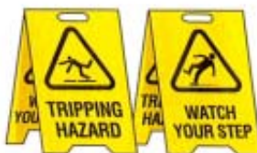
(legend 1) (legend 2) 839071