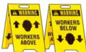
(legend 1) (legend 2) 839073