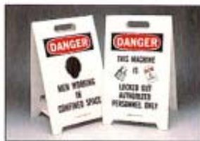
(legend 1) (legend 2) Both Sides 92289