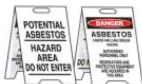
(legend 1) (legend 2) 92288