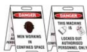
(legend 1) (legend 2) 92289