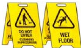
(legend 1) (legend 2) 839070