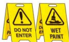
(legend 1) (legend 2) 839068