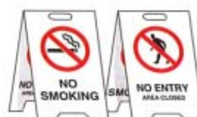
(legend 1) (legend 2) 839077